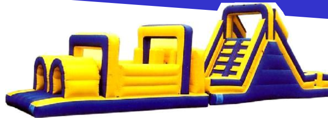
Our 52-foot obstacle course!